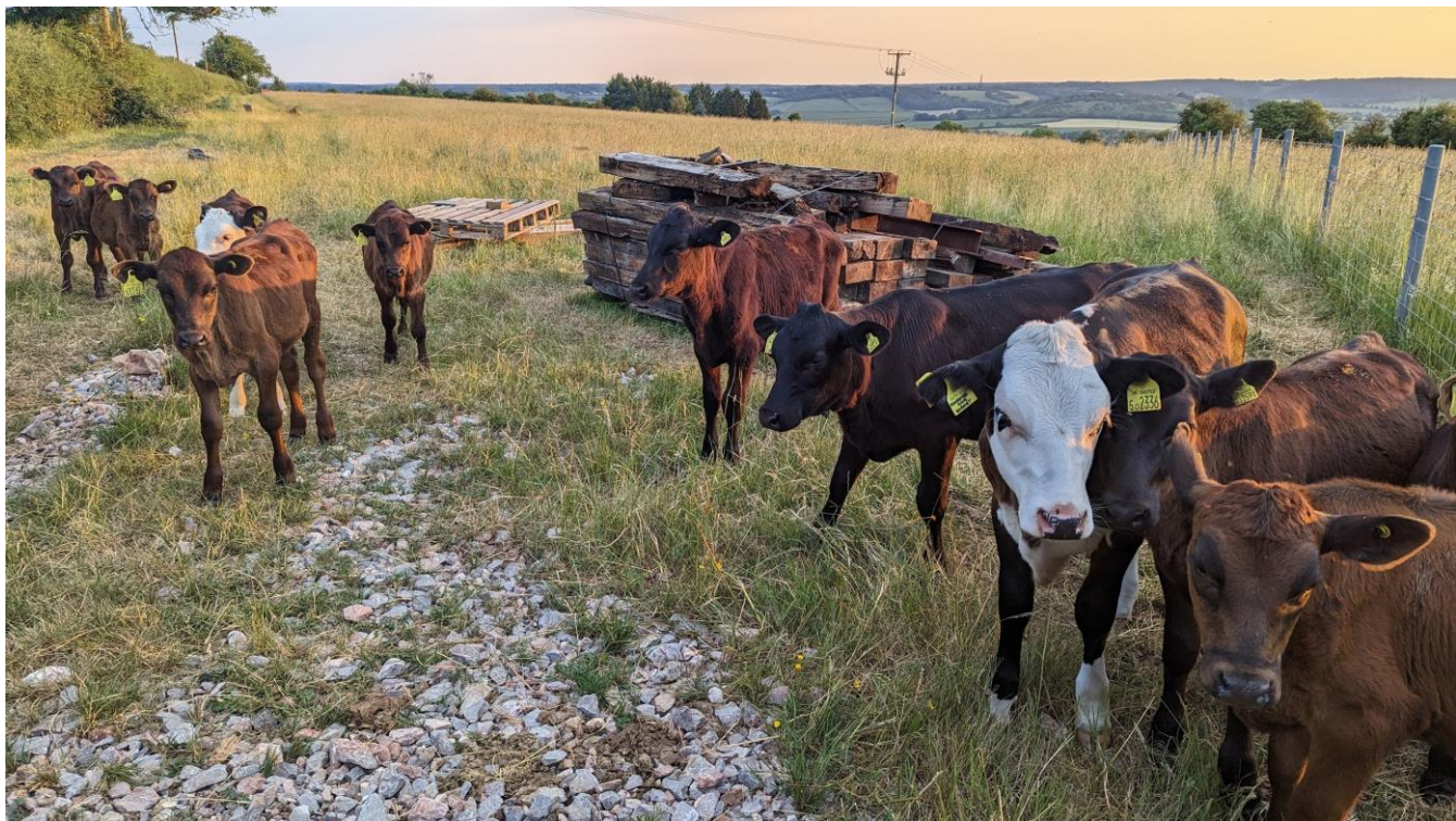
The lively and curious young heffers in the field by Pink Road